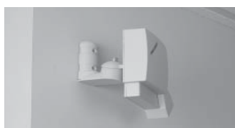
Small housing panel on MPAB11 wall mount