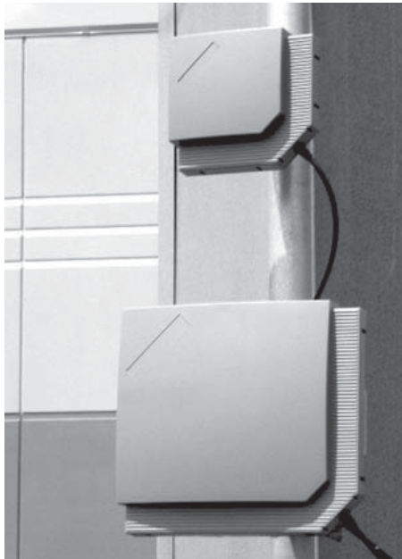
WISP Directional Panels