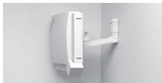
13 dBi panel on MPAB12 corner wall mount