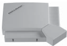
Small housing panels are 5.1" H x 4.7" W x 1.5" D