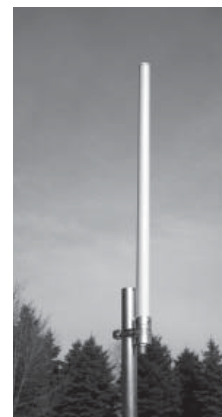
MMO 5.8 GHz series antennas